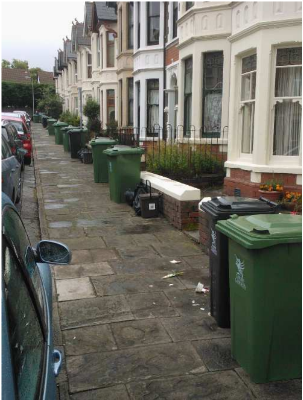
Collection with bags.....and with bins