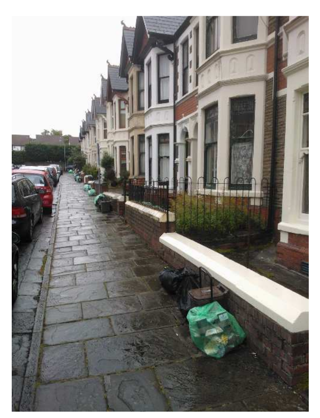
.....and after collection. No bins!